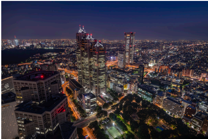
Focal Length: 19mm Exposure: F/9 30sec ISO: 64

Ultra-optimized optics create yet another incredible image