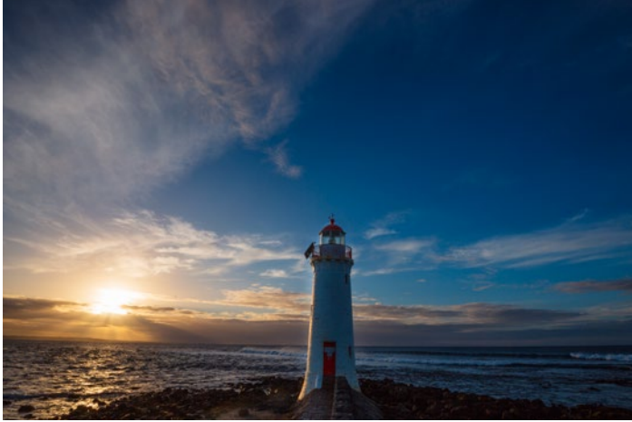
Focal Length: 17mm Exposure: F/16 1/125sec ISO: 100

Beautifully captures the inspiring images unfolding before you