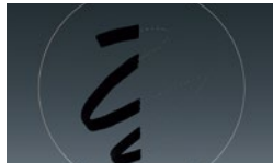
Left side: Without Fluorine Coating Right side: With Fluorine Coating

The front surface of the lens element is coated with a protective fluorine compound that is water- and oil-repellant. The lens surface is easier to wipe clean and is less vulnerable to the damaging effects of dirt, dust, moisture and fingerprints. Leak-proof seals throughout the lens barrel further protect your equipment, especially when shooting outdoors.