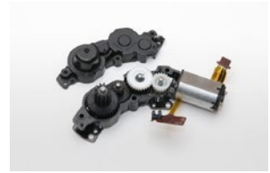
OSD unit for Model A037

The AF drive employs a newly developed OSD (Optimized Silent Drive) to ensure silent operation. Upgraded and optimized for even further reduction in drive noise, this drive allows the lens to be used to your heart's content in all situations where silence is required. With its greatly enhanced quality and speed, the new outstanding AF performance and tracking capabilities mean you never have to worry about missing a shot even when focusing on moving subjects.