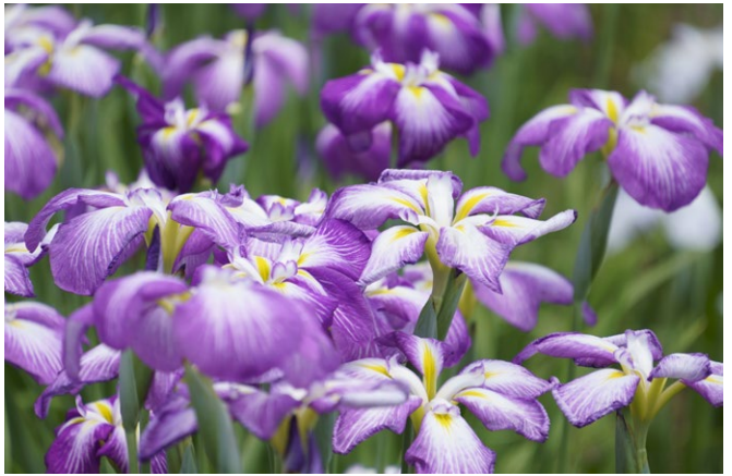
Camera: Sony α6600 Focal Length: 300mm Exposure: F6.3 1/200sec ISO: 100

The 18-300mm F/3.5-6.3 Di III-A VC VXD (Model B061) is an all-in-one zoom lens for Sony E-mount and FUJIFILM X-mount APS-C mirrorless cameras. It is the first¹ lens in the world for APS-C mirrorless cameras with a zoom ratio of 16.6x and 18-300mm focal length range (27-450mm full-frame equivalent). This all-in-one zoom lens covers up to 300mm telephoto and is well-balanced with aspherical and special lens elements to achieve high image quality over the entire range. Plus, like most of TAMRON's other lenses for mirrorless cameras, the filter size is unified at 67mm. This all-in-one zoom lens makes photography more fun because you can use it in an unlimited number of situations. It's so versatile, it will inspire your creativity.